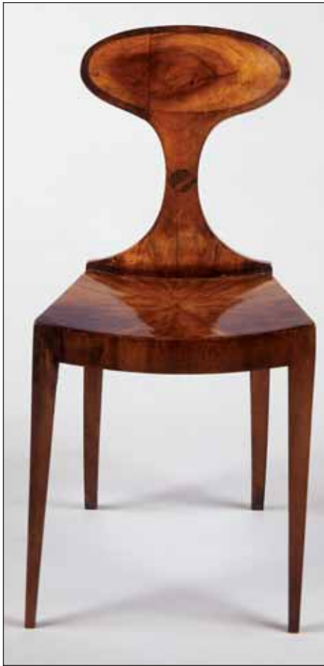
THIS PAGE, CLOCKWISE FROM UPPER LEFT:

Fig. 5: Chair, Bohemia, 1815–1820. Walnut veneer on beech and softwood. H. 88, W 44, D 42 cm. Museum of Decorative Arts, Prague. Acquisition, 1971 (74.912/1971); photography by Miloslav Sebek.