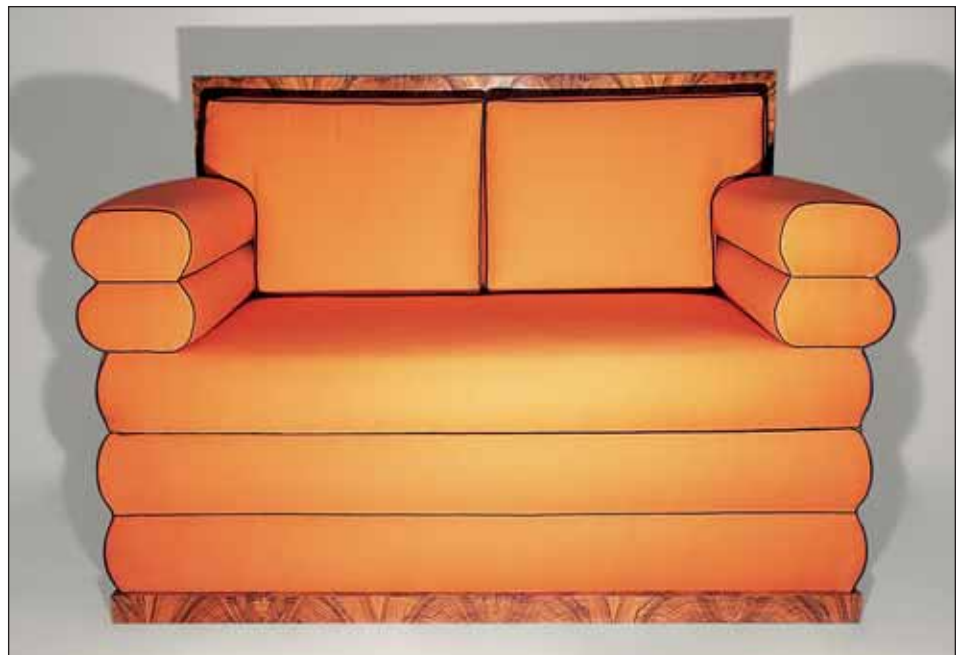
Fig. 7: Settee, Vienna, 1825–1830. Walnut veneer on softwood, modern upholstery. H. 92.5, W 132, D. 69 cm. Milwaukee Art Museum, Gift of René von Schleinitz Memorial Fund (M2005.146); photography by Lois Lammerhuber, Vienna.

Fig. 6: Settee, Vienna, circa 1815. Danhauser'sche Möbelfabrik (founded 1814). Mahogany veneer, gilding, reconstructed upholstery. H. 113, W. 214, D 66 cm. Milwaukee Art Museum, Gift of René von Schleinitz Memorial Fund, by exchange (M2001.61); photography by Lois Lammerhuber, Vienna.