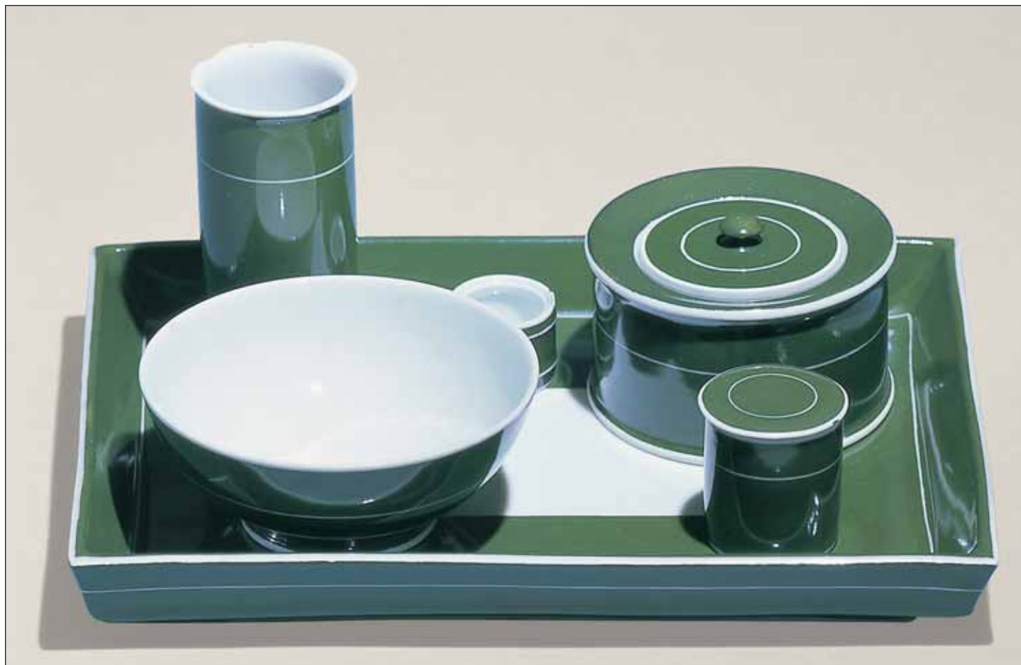
Fig. 12: Writing set, Vienna, 1823–1824. Wiener Porzellanmanufaktur (1718–1864). Porcelain, green underglaze. Tray, 3.8 x 29.6 x 21.6 cm. Bundesmobilienvverwaltung, Silberkammer Wien, Vienna (MD 039251, 001-008); photography by Lois Lammerhuber, Vienna.

January 15, 2008). For information call 414.224.3264, or visit www.mam.org .