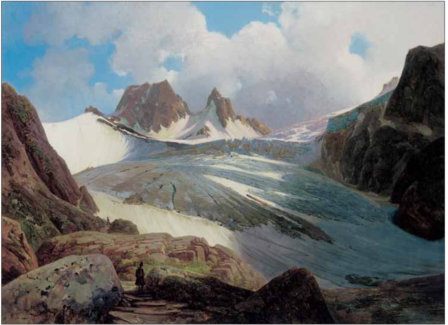
Fig. 10: Thomas Ender (Vienna 1793–1875 Vienna). The Vogelmaier Ochsenkar Kees in the Rauris Valley of the High Tauern , 1834. Oil on canvas. 26.7 x 36.2 cm. Vaduz/Vienna, Sammlungen des Fürsten von und zu Liechtenstein (GE 2001).

thought to date from the 1920s or even the 1960s. The upholstery assumes a weight-bearing, tectonic function similar to the use of veneers in cabinetmaking.