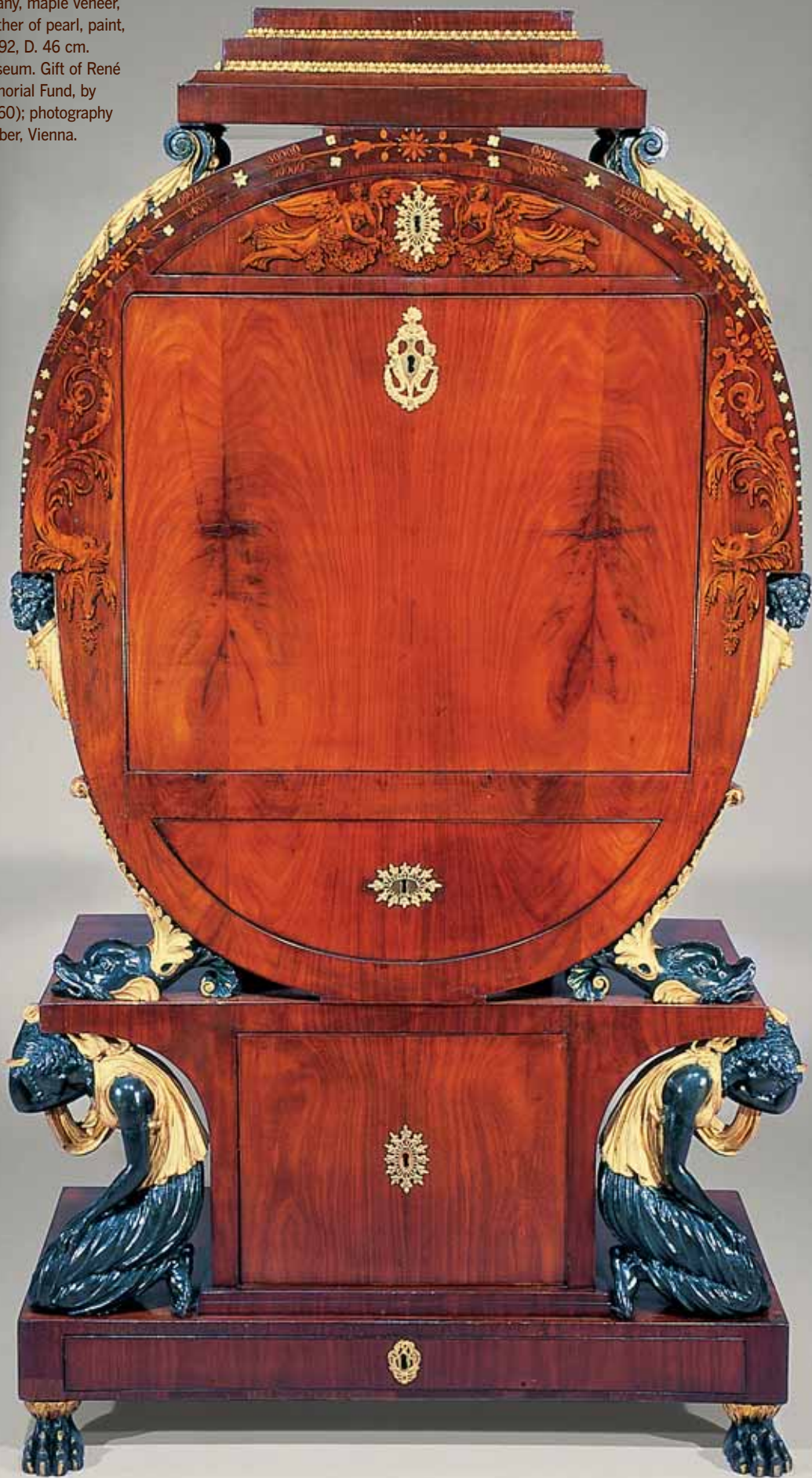
Fig. 1: Writing cabinet, Vienna, 1810–1815. Mahogany, maple veneer, ebonized pear, mother of pearl, paint, gilding. H. 155, W. 92, D. 46 cm. Milwaukee Art Museum. Gift of René von Schleinitz Memorial Fund, by exchange (M2001.60); photograph by Lois Lammerhuber, Vienna.