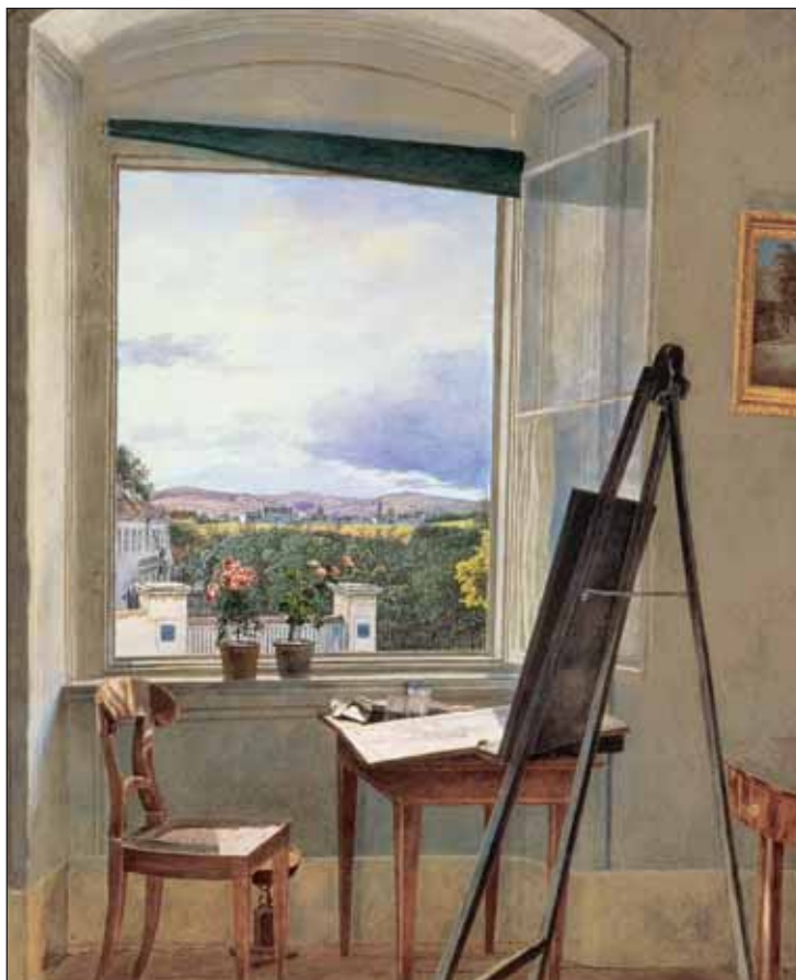
THIS PAGE, LEFT TO RIGHT:

Fig. 8: Georg Friedrich Kersting (Güstrow, Mecklenburg 1785–1847 Meissen), Woman Embroidering , 1817. Oil on panel. 47.1 x 36.8 cm. National Museum, Warsaw. Purchase, 1986 (M.Ob.2073); photography by Teresa Zóltowska-Huszczka. Fig. 9: Jakob Alt (Frankfurt am Main 1789–1872 Vienna), View from the Artist's Studio in Alservorstadt toward Dornbach , 1836. Watercolor over pencil. 51.1 x 42.1 cm. Albertina, Vienna (28336).