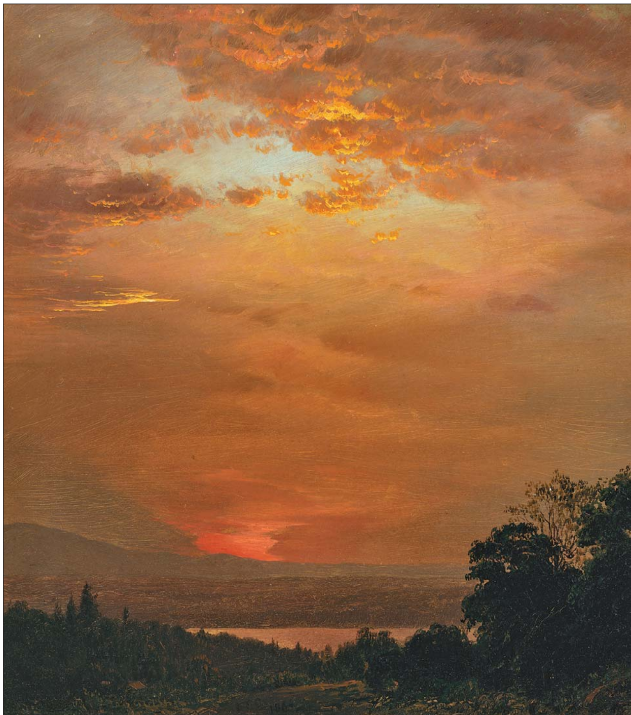
Fig. 9: Frederic Edwin Church (1826-1900), Looking West from Olana, 1864. Oil on artist's board, 13 x 12 inches.