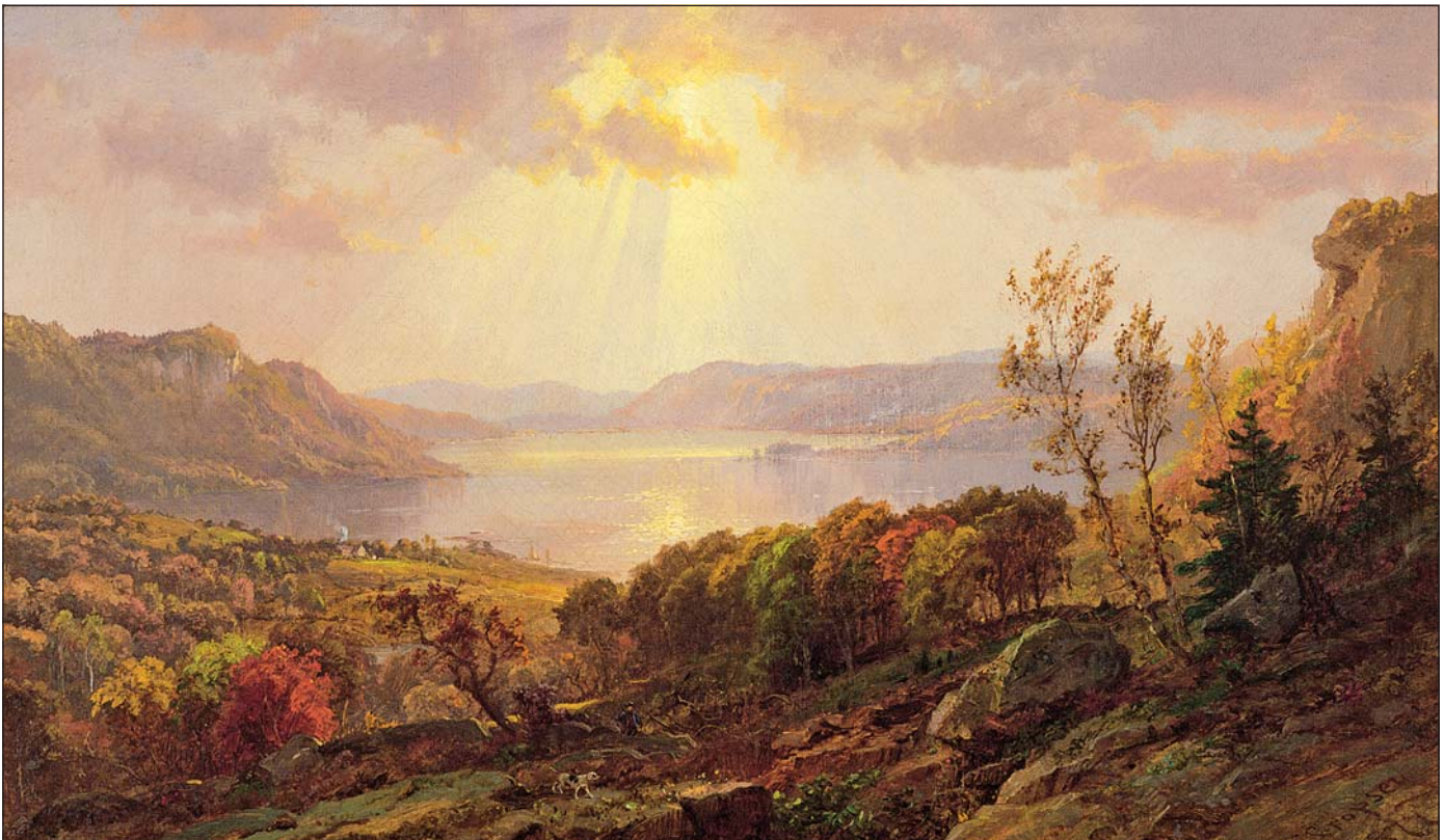
Fig. 6: Jasper F. Cropsey (1823-1900), On the Hudson Near West Point , 1877. Oil on canvas, 12 x 20 inches. Courtesy private collection.